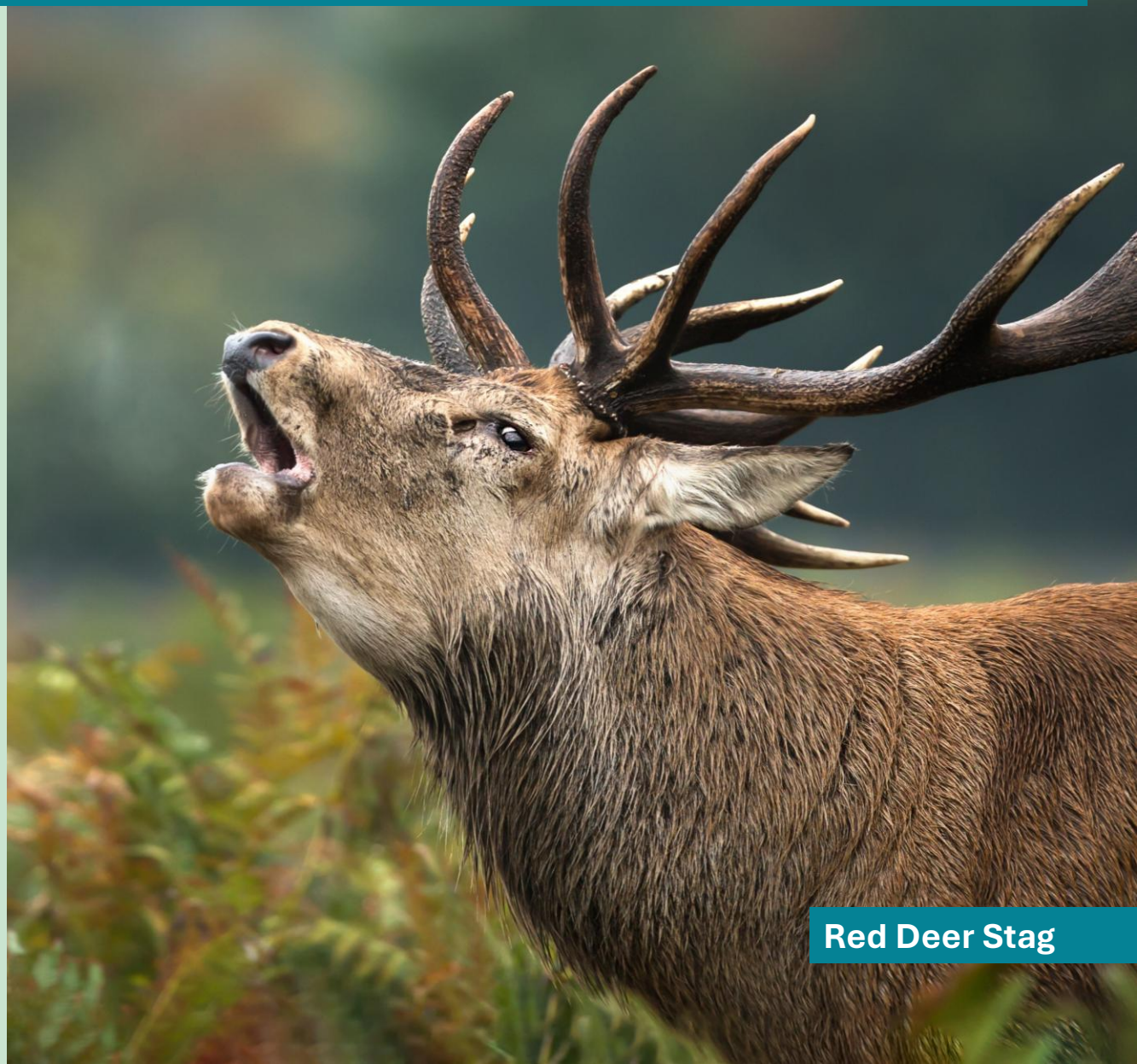
Red Deer Stag