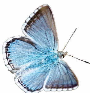
Chalkhill blue are only found in chalk grasslands in southern England.

Suffolk Wildlife Trust has a vision for creating a wilder Suffolk where thriving nature and healthy rivers support resilient communities, businesses, and wildlife. In West Suffolk, we are working to make sure growth and development is genuinely sustainable and does more to help wildlife. At our Lackford Lakes and Wangford Warren nature reserves we are restoring wildlife habitats and providing places people can experience and enjoy the benefits of spending time in nature.