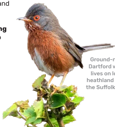
Ground-nesting Dartford warbler lives on lowland heathland across the Suffolk coast.

Suffolk Wildlife Trust is bringing back nature across the Suffolk Coast. With our partners, farmers, and landowners, we are working to improve water quality and wildlife in the River Deben and Deben Estuary through initiatives like the River Deben Source to Sea project. At our nature reserves, including Martlesham Wilds 'wilding' reserve, we are restoring wildlife habitats and helping people to enjoy and connect with nature.